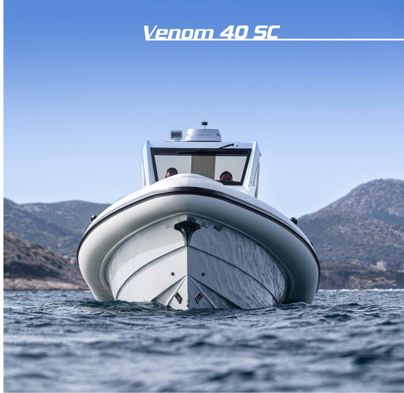
Venom 40 SC