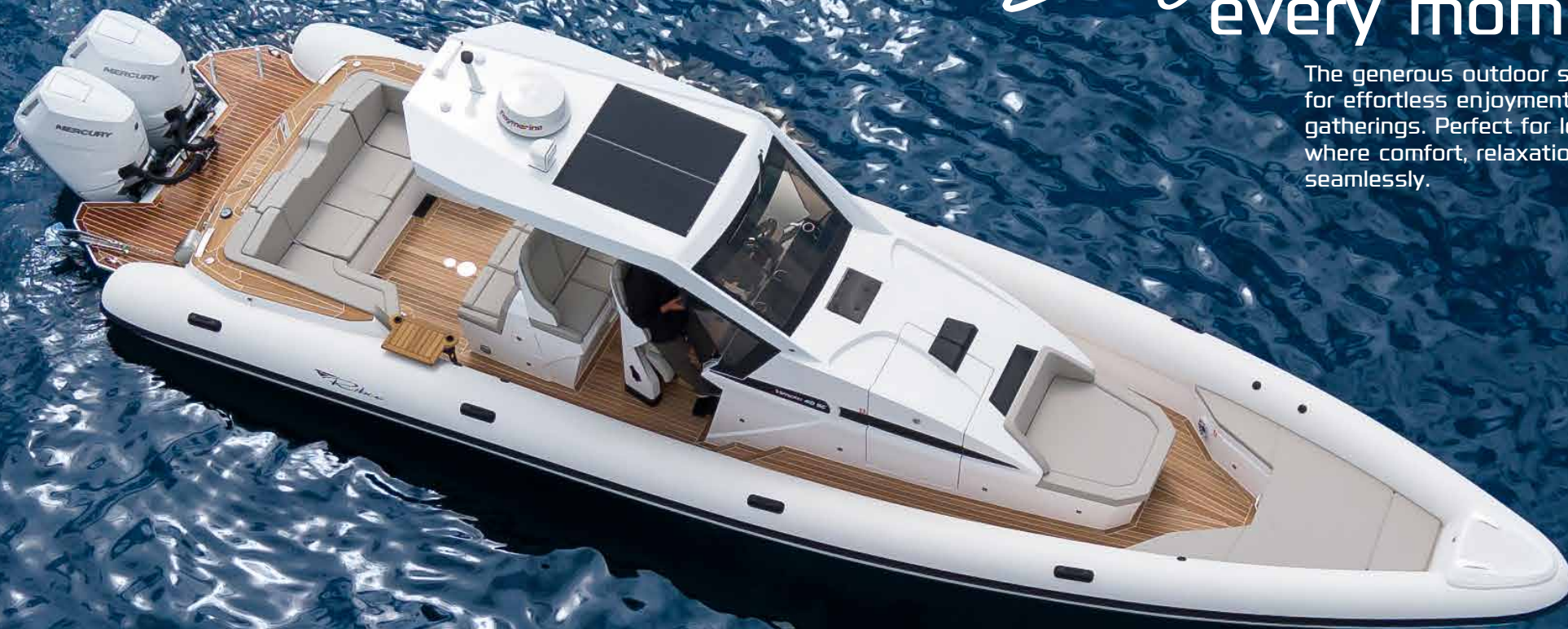
Venom 40 SC

The generous outdoor spaces are designed for effortless enjoyment and unforgettable gatherings. Perfect for long days at sea, where comfort, relaxation, and hosting blend seamlessly.